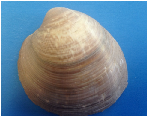
Concentric growth lines (radiate out from hinge)