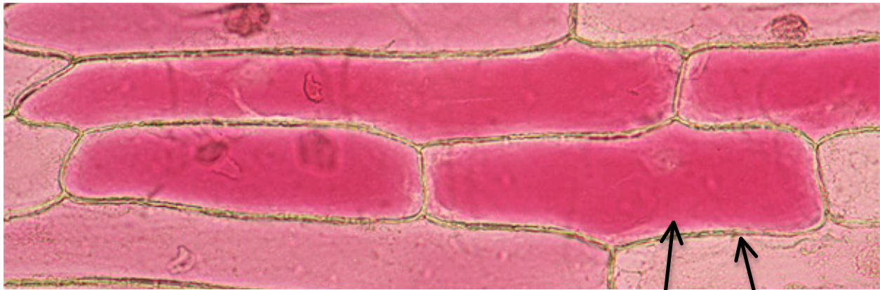
In Distilled Water